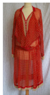
1920s red silk day dress