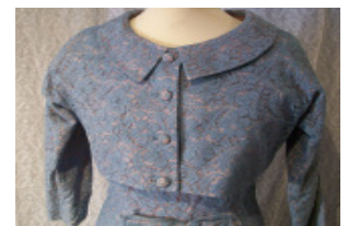
1950s blue lace dress & jacket