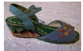
1940s wooden-soled shoes