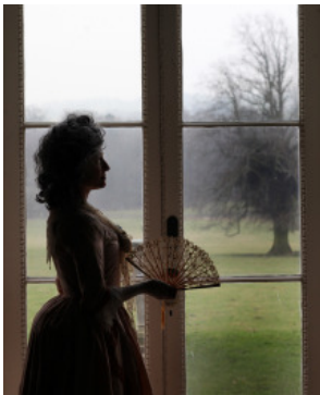
Portrait of a Lady at Wallington

Wallington House in Northumberland is a beautiful National Trust property in possession of a unique painting that can claim to be the work of not one but two of England's greatest artists.