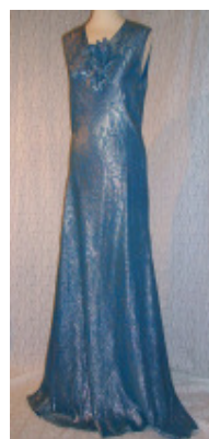
1930s blue lame evening dress