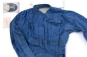
WWI nurse's uniform