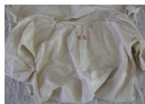
1820s linen chemise